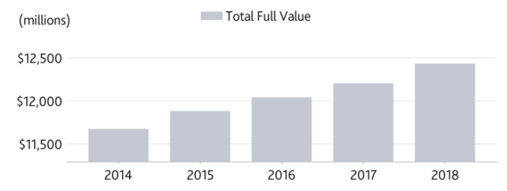
EXHIBIT 3 Full value of the property tax base increased from 2014 to 2018